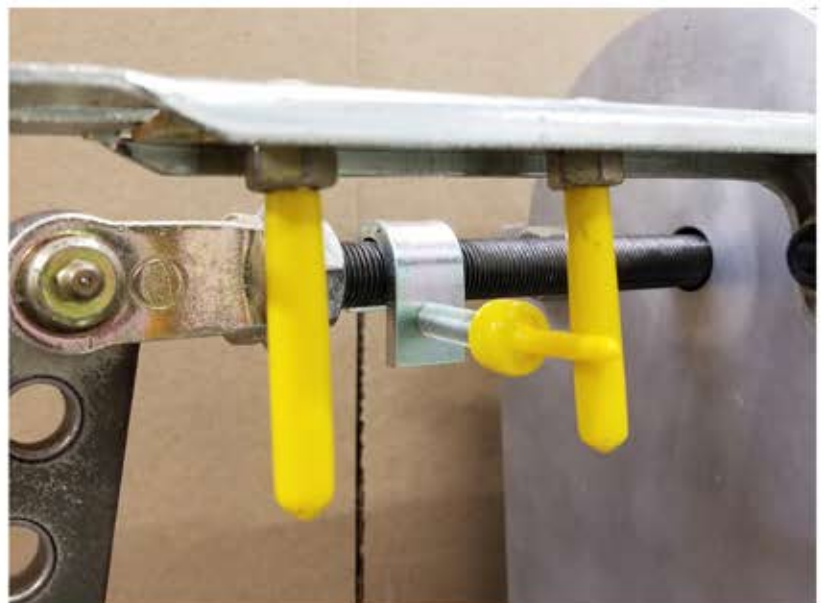
TRAILER AXLE - BRAKE RELEASED POSITION